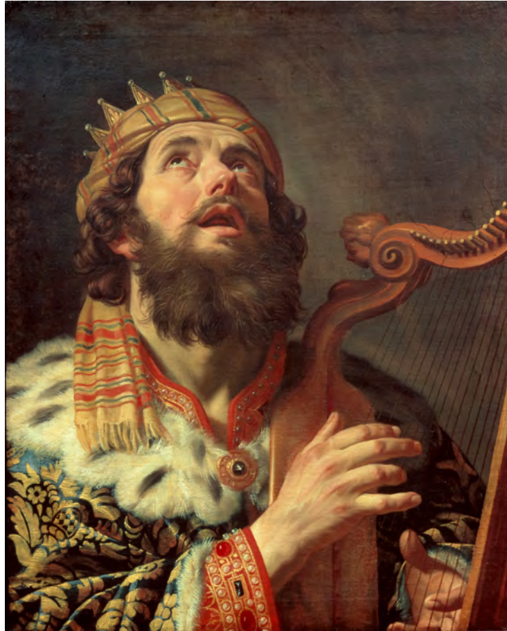
Figure 7. Gerard van Honthorst: King David playing the harp

David and the Psalms. The Psalms, many of which are traditionally ascribed to David and Solomon, include some of the richest prophecies and expositions of temple themes in scripture. 47 Although we typically read them aloud today in the same fashion as we read other passages of scripture, in fact they are written as lyrics for musical performances where human and instrumental voices were to be inseparably blended, thus providing a potent echo of the divine Voice.