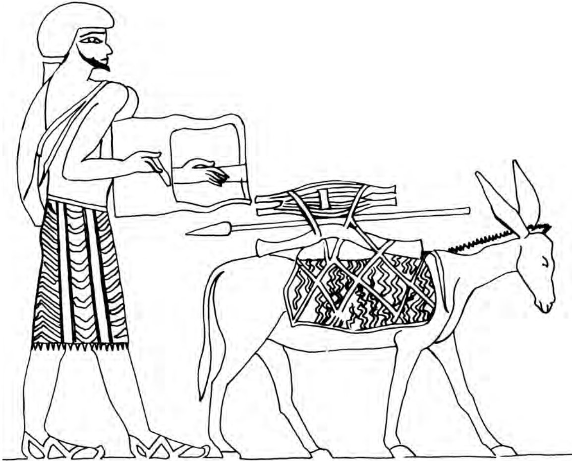
Figure 1. Lyrist from the tomb-painting of Khnumhotep II, Beni-Hasan, Egypt. Twelfth Dynasty, ca. 1900 BCE 2

An Old Testament KnowWhy 1 relating to the reading assignment for Gospel Doctrine Lesson 22: “The Lord Looketh on the Heart” (1 Samuel 9-11; 13; 15-17) (JBOTL22A)