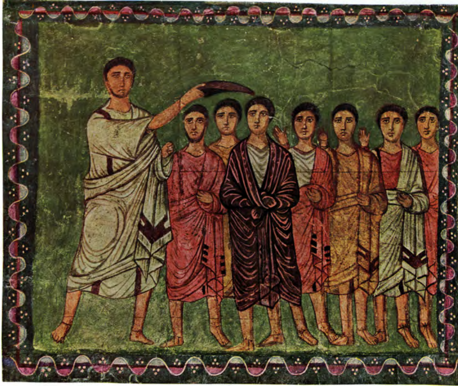
Figure 5. Samuel anoints David. Dura Europos Synagogue, ca. AD 254

David plays the lyre before Saul. As Saul repeatedly defies the instructions of Samuel and the law of the Lord, the Spirit withdraws from him. 36 The Lord tells Samuel that he must seek out a new king and anoint him secretly. 37 The same Spirit that has left Saul will now fall upon David.