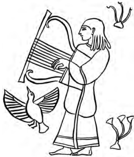
Figure 12. Detail from 'Sea Peoples' reliefs, Medinet Habu, reign of Ramses III (ca. 1184–1152 BCE) 81