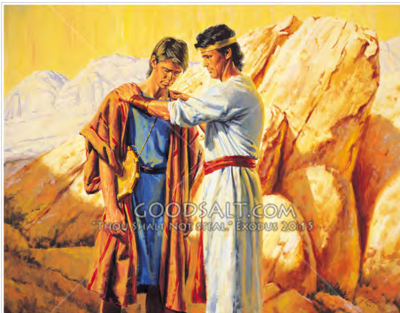
Figure 8. Jonathan invests David with his princely garments and weapons

This is precisely the context of prophetic passages in the Bible 50 and the Doctrine and Covenants 51 where the faithful are seen in future scenes as singing a “new song.” The emphasis on the “newness” of the song is not to signal to eager ears that tired, old songs are being put aside in favor of more refreshingly relevant ones. 52 Rather, the song is “new” because it is being newly revealed through the Spirit as it is being voiced; it is “new” because the singing is freshly spoken from the mouth of God through His servants, whether or not the words have been sung previously. 53