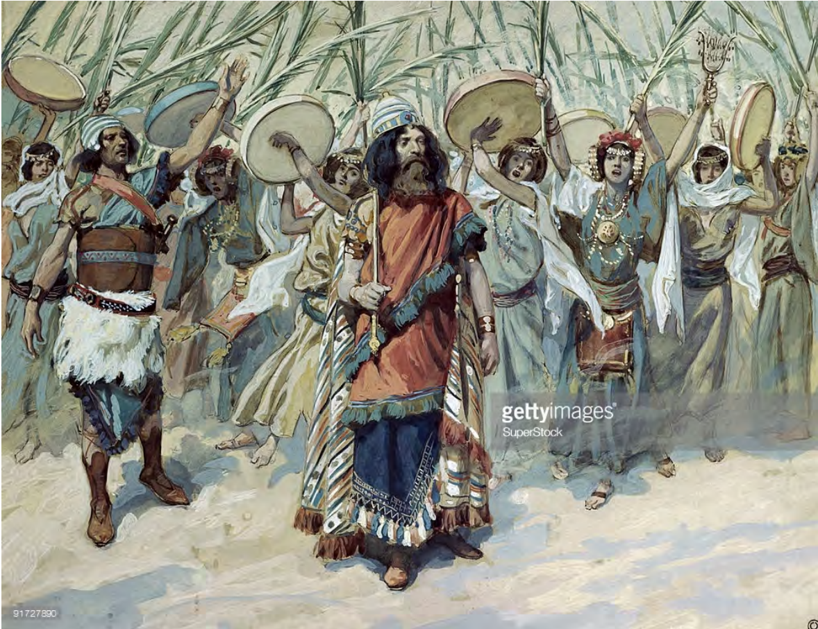
Figure 9. Tissot: David's return

Whereas Jonathan recognizes David's honors as rightfully deserved, his military exploits only serve to stoke the jealousy and murderous rage of Saul. 60 Particularly galling was the praise of the women in "singing and dancing, ... with tabrets, with joy, and with instruments of musick" 61 after David's victory over the Philistines. The words of their antiphonal chorus explicitly highlighted the difference in popular perception between the increasingly unstable king and the rising young hero: "Saul hath slain his thousands, and David his ten thousands": 62