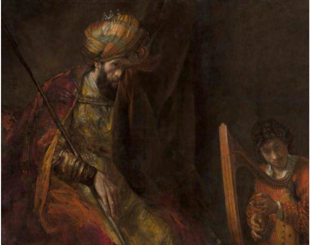
Figure 6. Rembrandt: David playing before Saul, 1658-1659.

With this discussion as background we can better understand the story of David's beneficial employ of music to dispel the evil spirit that plagued Saul. 41 An ancient reader of the story would have recoiled in disgust at a trivialized description of David's practice of a divine art as "music therapy." 42 The view of the Bible is that the effectiveness of the music was not due primarily to David's diligent hours of mastering musical technique in the field as a shepherd, but rather to the God who infused the songs with spiritual power as a gift to His faithful servant. As Saul ultimately came to know, David's most important qualifications as a "cunning player" 43 — and later as a rival for the throne — were not derived from his inherent talents, but rather "because the Lord was with him." 44