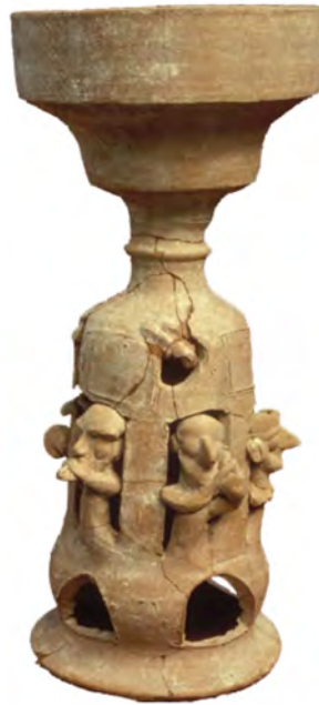
Figure 4. Philistine cult stand in terra cotta from Ashdod decorated with five figures, four of which appear to be playing musical instruments: "cymbals, double pipe, lyre, and tambourine," 11th-10th century BCE 31

The encounter of Saul with the company of prophets can be compared with "the story told in Numbers about Yahweh coming down to talk with Moses and seventy elders, and to put on the seventy some of the spirit that was already on Moses. 29 When this happened, the elders 'prophesied' 30 —the same Hebrew verb is used with respect to the company of prophets described in 1 Samuel 10:10.