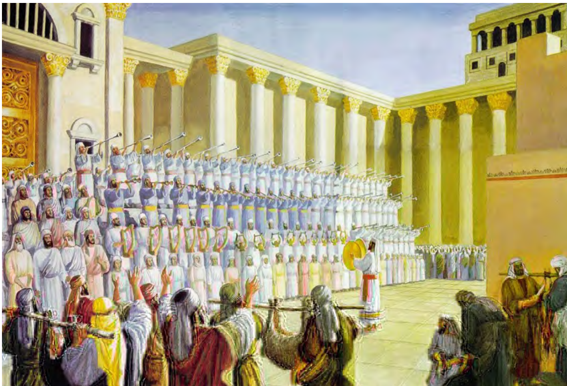
Figure 13. Temple choir and orchestra

All three rituals include seven ... song-acts governing the establishment, building, or maintenance of the cult center. The continuity between these events is made explicit. Solomon's completion of the Temple is seen as the fruition of David's own vision; the Levites minister "with instruments for music ... that King David had made for giving thanks to the Lord." 99 Hezekiah's musicians were stationed, says the Chronicler, "according to the commandment of David." 100