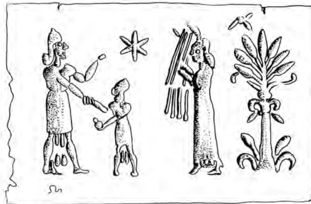
Figure 2. “Harp treaty.” Drawing based on an unprovenanced Mesopotamian cylinder seal, ca. fourteenth century BCE 19

Consistent with these harbingers in the first few chapters of Genesis, Jewish and Muslim sources often described musical developments during the patriarchal age in negative terms. For example, The Sethites and the Cainites (from the second temple period) speaks of these innovators as “evil and disorderly” men who, at the direction of the “Malicious One,” discovered “false music and dances and musical instruments.” 16 The music that “led them into confusion” is said to have had a “prominent role ... in the seduction of the Sethite men by the Cainite women.” 17 The medieval Jewish scholar Rashi asserts that Jubal used these instruments “to play music for idolatry.” 18