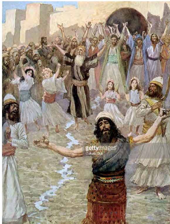
Figure 3. Tissot: Saul prophesies among the prophets

Saul among the prophets — and their music. In the Book of Mormon, Mosiah’s predictions of the likely abuses of the institution of kingship are accepted by most of the people even though the reigns of Mosiah and his father Benjamin had been successful in every measure. In place of kingship, a system of judges was created whereby leaders were to rule according to God’s law rather than man’s whim. 23