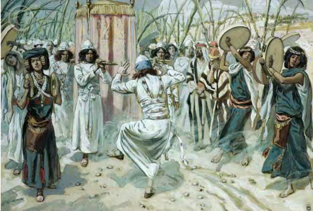
Figure 10. Tissot: David dances before the Lord

David dances before the Lord. Ironically, Saul was figuratively “among the prophets” 63 once again when he correctly predicted David’s rise and his own downfall. The praise of “all cities of Israel” 64 that were heaped upon David at this earlier incident anticipated David’s later triumphal entry into Jerusalem with the Ark of the Covenant as both a king and priest. 65 This second time the focus was not the women but rather on David himself, who danced with memorable exuberance. 66 The scriptural description — that “David danced before the Lord with all his might” 67 — epitomizes the same spirit of single-minded, wholehearted consecration to the service of God that is enjoined in Deuteronomy 6:5. 68