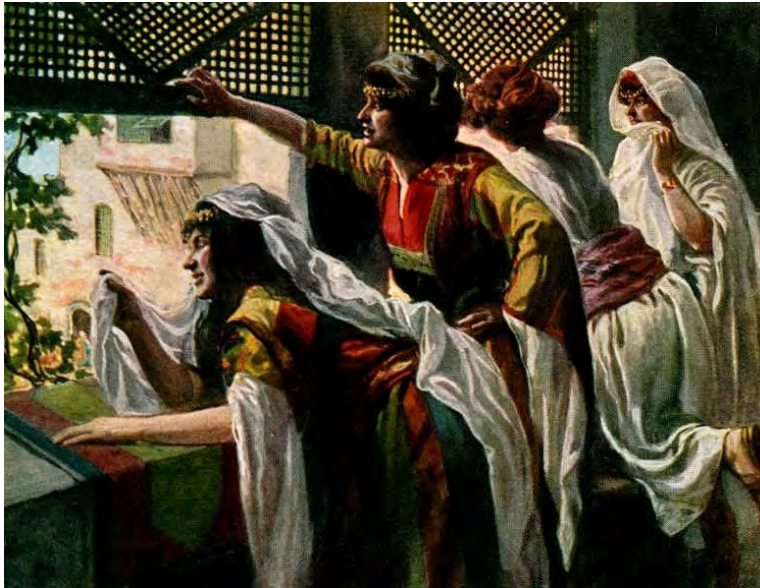
Figure 11. Tissot: Michal despises David.

After David consulted with the country’s leading men, and drew up the new musical groups of string-players, cymbalists, frame-drummers, and trumpeters, “the whole people” — some seventy thousand in the LXX [i.e., the Septuagint, an ancient Greek translation of the Hebrew Bible] — “came together as they had planned.” The expression suggests a staged crowd as much as a spontaneous popular movement. The Ark was borne out on a river of sound.